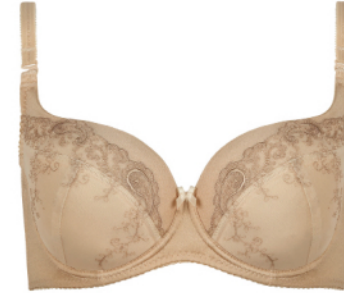
YVETTE/B4 PADDED BRA B-400A

65 C-H, 70 B-H, 75 B-H, 80 B-H, 85 B-H, 90 B-H, 95 B-G, 100 D-F