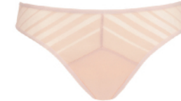
LUNA/F PANTY Sizes: 36-48