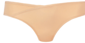
VENUS/S THONG Sizes: 36-46