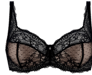
SCARLET/B3 HALF-PADDED BRA B-302 65 C-H, 70 B-H, 75 B-H, 80 B-H, 85 B-H, 90 B-H, 95 B-G, 100 D-F