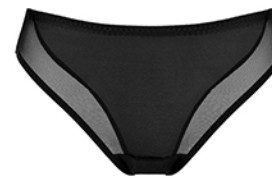
ZARA/S THONG Sizes: 36-52