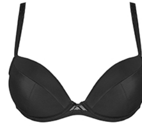
ZARA/B1 PUSH-UP BRA B-108 65 B-F, 70 A-F, 75 A-E, 80 B-D, 85 B-C