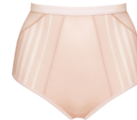
LUNA/FW HIGH WAIST PANTY Sizes: 36-48