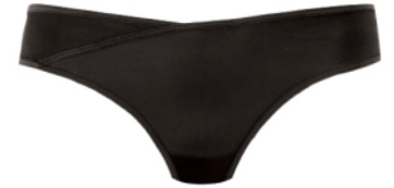
VENUS/S THONG Sizes: 36-46