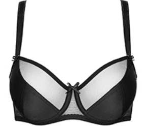
ZARA/B2 V2 SOFT BRA B-209 65 E-J, 70 D-L, 75 C-L, 80 B-L, 85 B-L, 90 B-L, 95 B-K, 100 D-J