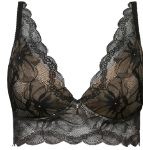
CHARLIZE/PG1 PUSH-UP HALF-CORSET PG-103