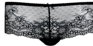
SCARLET/SZ SHORTS Sizes: 36-48