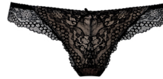
SCARLET/S THONG Sizes: 36-46