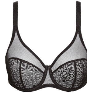
GABI/B2 V1 SOFT BRA B-208

65 E-H, 70 D-H, 75 C-H, 80 B-H, 85 B-G, 90 B-F, 95 B-E