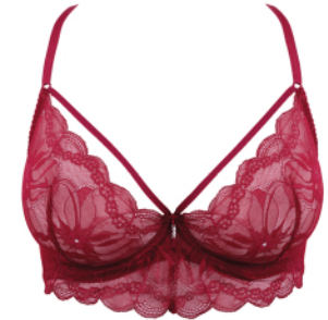
CHARLIZE/B2 SOFT BRA B-203