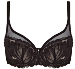
MOON/B4 PADDED BRA B-406

65 C-H, 70 B-H, 75 B-H, 80 B-H, 85 B-H, 90 B-H, 95 B-G, 100 D-F