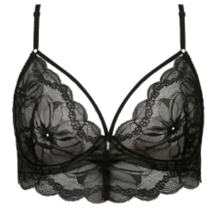
CHARLIZE/B2 SOFT BRA B-203