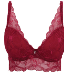
CHARLIZE/PG1 PUSH-UP HALF-CORSET PG-103