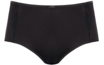
VENUS/SZ SHORTS Sizes: 36-48