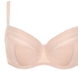
LUNA/B4 PADDED BRA B-402 65 C-H, 70 B-H, 75 B-H, 80 B-H, 85 B-H, 90 B-H, 95 B-G, 100 D-F