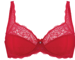
SCARLET/B3 HALF-PADDED BRA B-302

65 C-H, 70 B-H, 75 B-H, 80 B-H, 85 B-H, 90 B-H, 95 B-G, 100 D-F