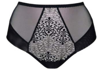
GABI/FW HIGH WAIST PANTY