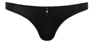
CARLA/S THONG Sizes: 36-46