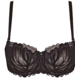
MOON/B1 PUSH-UP BRA B-107