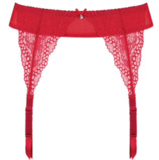
SCARLET/PPN GARTER BELT