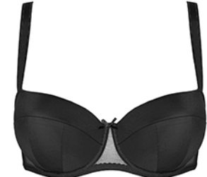
ZARA/B4 PADDED BRA B-429 65 E-H, 70 D-H, 75 C-H, 80 B-H, 85 B-G, 90 B-F, 95 B-E