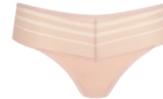
LUNA/S THONG Sizes: 36-46