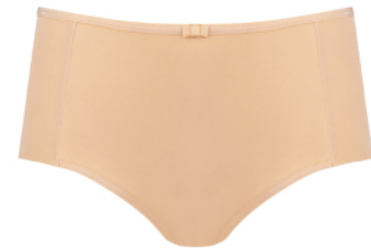
VENUS/SZ SHORTS Sizes: 36-48