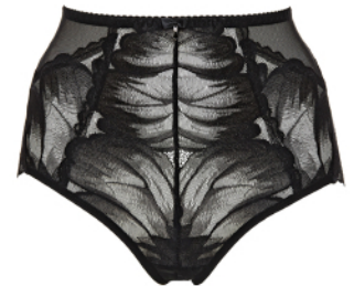
MOON/FW HIGH WAIST PANTY