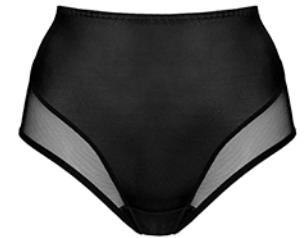
ZARA/FW HIGH WAIST PANTY Sizes: 36-52