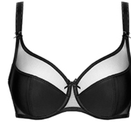
ZARA/B3 HALF-PADDED BRA B-309 65 E-J, 70 D-L, 75 C-L, 80 B-L, 85 B-L, 90 B-L, 95 B-K, 100 D-J