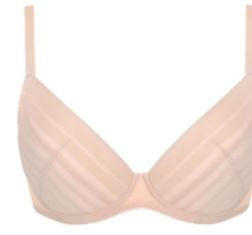
LUNA/B1 PUSH-UP BRA B-103 65 B-F, 70 A-F, 75 A-E, 80 B-D, 85 B-C