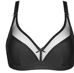
ZARA/B2 V1 SOFT BRA B-229 65 E-J, 70 D-L, 75 C-L, 80 B-L, 85 B-L, 90 B-L, 95 B-K, 100 D-J