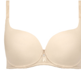
CARLA/B5 MOULDED CUP BRA B-501

65 B-H, 70 A-H, 75 A-H, 80 B-G, 85 B-F, 90 B-E, 95 B-D