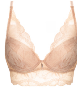
CHARLIZE/PG1 PUSH-UP HALF-CORSET PG-103