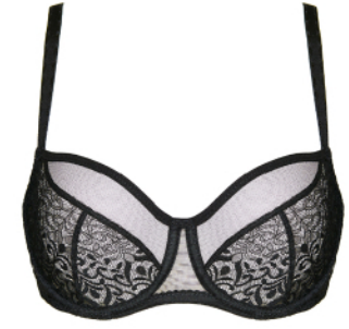
GABI/B2 V2 SOFT BRA B-209

65 E-H, 70 D-H, 75 C-H, 80 B-H, 85 B-G, 90 B-F, 95 B-E