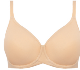
VENUS/B5 MOULDED CUP BRA B-502 65 E-J, 70 D-J, 75 C-J, 80 B-I, 85 B-H, 90 B-G, 95 B-F, 100 D-E