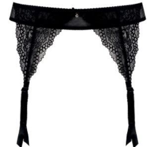
SCARLET/PPN GARTER BELT Sizes: 36-48