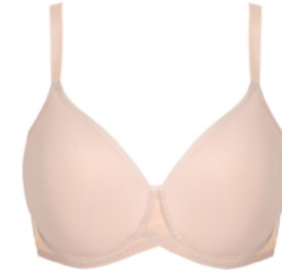
LUNA/B5 MOULDED CUP BRA B-502 65 E-J, 70 D-J, 75 C-J, 80 B-I, 85 B-H, 90 B-C, 95 B-F, 100 D-E