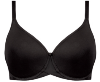
VENUS/B5 MOULDED CUP BRA B-502 65 E-J, 70 D-J, 75 C-J, 80 B-I, 85 B-H, 90 B-G, 95 B-F, 100 D-E