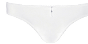
CARLA/F PANTY Sizes: 36-48