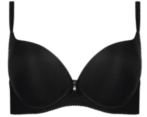
CARLA/B5 MOULDED CUP BRA B-501

65 B-H, 70 A-H, 75 A-H, 80 B-G, 85 B-F, 90 B-E, 95 B-D