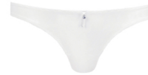
CARLA/S THONG Sizes: 36-46