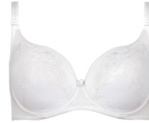
YVETTE/B4 PADDED BRA B-400A

65 C-H, 70 B-H, 75 B-H, 80 B-H, 85 B-H, 90 B-H, 95 B-G, 100 D-F