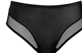
ZARA/F PANTY Sizes: 36-52