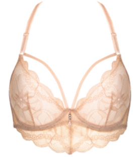
CHARLIZE/B2 SOFT BRA B-203