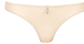
CARLA/S THONG Sizes: 36-46

65 B-H, 70 A-H, 75 A-H, 80 B-G, 85 B-F, 90 B-E, 95 B-D