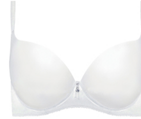
CARLA/B5 MOULDED CUP BRA B-501

65 B-H, 70 A-H, 75 A-H, 80 B-G, 85 B-F, 90 B-E, 95 B-D