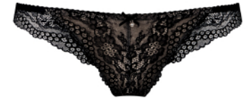
SCARLET/F PANTY Sizes: 36-48