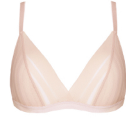
LUNA/B2 SOFT BRA B-204 Sizes: 36-42