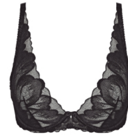
MOON/B2 SOFT BRA B-203